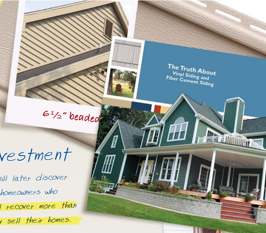
6 1/2" beaded