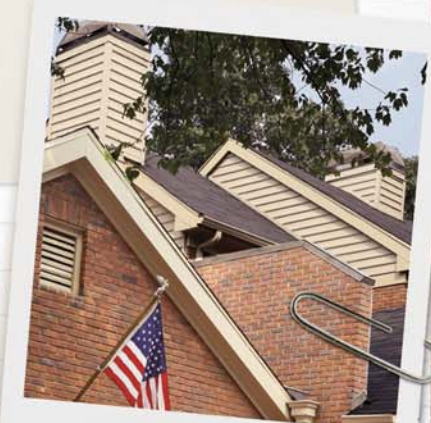
A beautiful combination