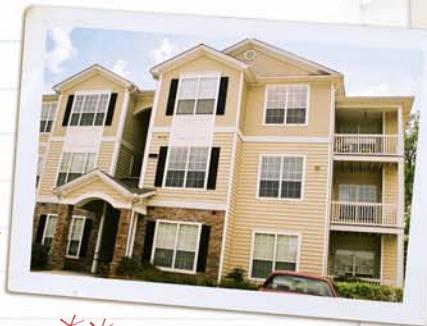
** One of Taylor's Condos

Maintenance freedom means vinyl siding will retain its beauty without requiring a line item in the association's budget. Unlike wood or fiber cement, vinyl siding never requires painting. A simple rinse with a garden hose or the use of household cleaning products maintains its original beauty for the lifetime of the residence.