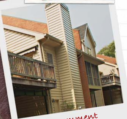
Every comment has been positive